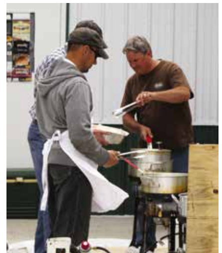
DCT employees preparing meal for the 2013 meeting.